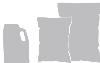
8 lb. Jug