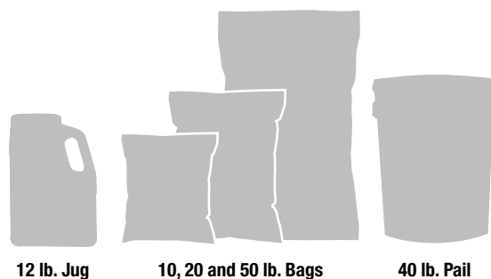
12 lb. Jug